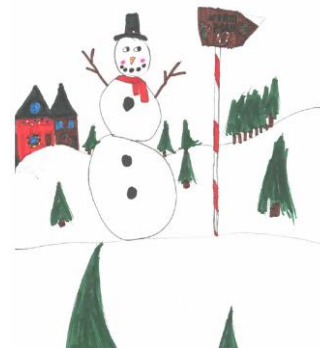
2 nd Place: Abby Rhodes